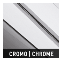
CROMO | CHROME