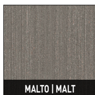
MALTO | MALT